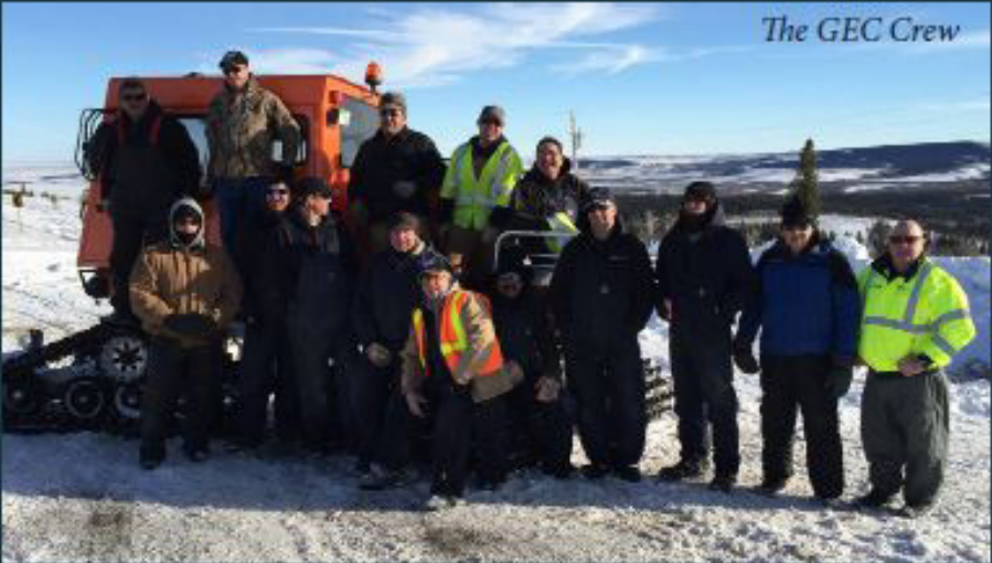
The GEC Crew